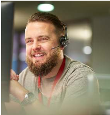
Customer Service Agent