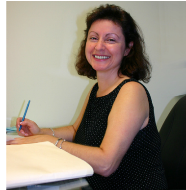
Human Resource Agent

Mariposa Department of Project Management.